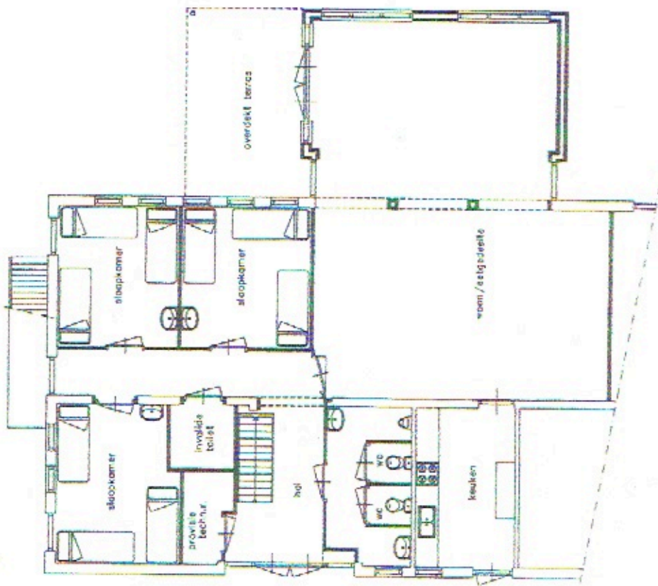
= Begone grond =